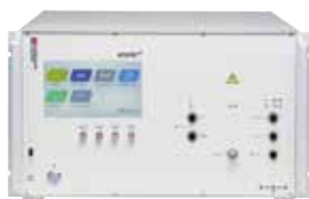
AXOS 8 Compact Test System Article no. 2490800

Surge 1.2/50 \mu s...8/20 \mu s IEC/EN 61000-4-5