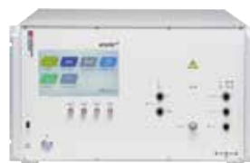
AXOS 8 Surge Test System Article no. 2490810

Surge 1.2/50 \mu s...8/20 \mu s IEC/EN 61000-4-5