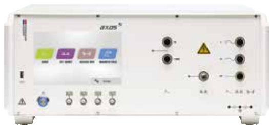
AXOS 5 front view

A wide range of cost-efficient and user friendly coupling / decoupling networks for power lines as well as for symmetrical and asymmetrical data- and signal lines are available as options.