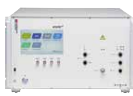
AXOS 8 EFT/Burst Test System Article no. 2490830

Surge 1.2/50 \mu s...8/20 \mu s IEC/EN 61000-4-5